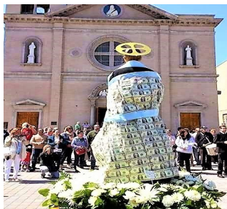
St. Gerard Birthday Mass