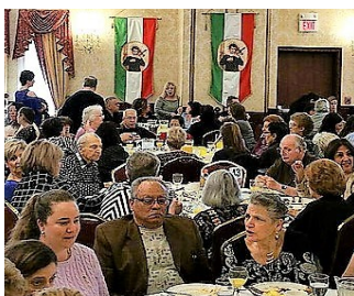
St. Gerard Breakfast